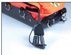
Low-Pressure Hose & Dual Manifold (with Hansen or Rectus fittings)