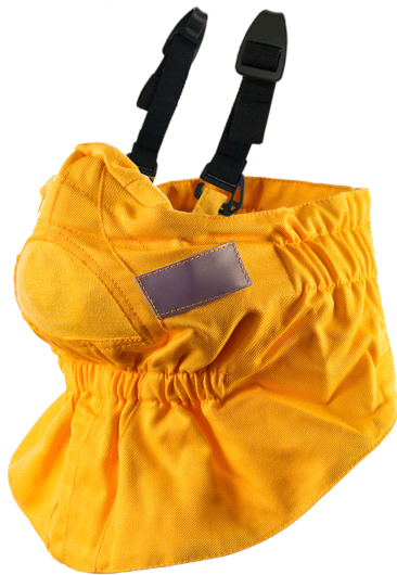
Side adjustment bands Picatinny System

The VFT Protective Mask is supplied with two lateral adjustment bands, which allow a quick and direct attachment to the helmet, improving the fit of the mask to the face of the combatant. This accessory is compatible with all forest firefighter helmets.